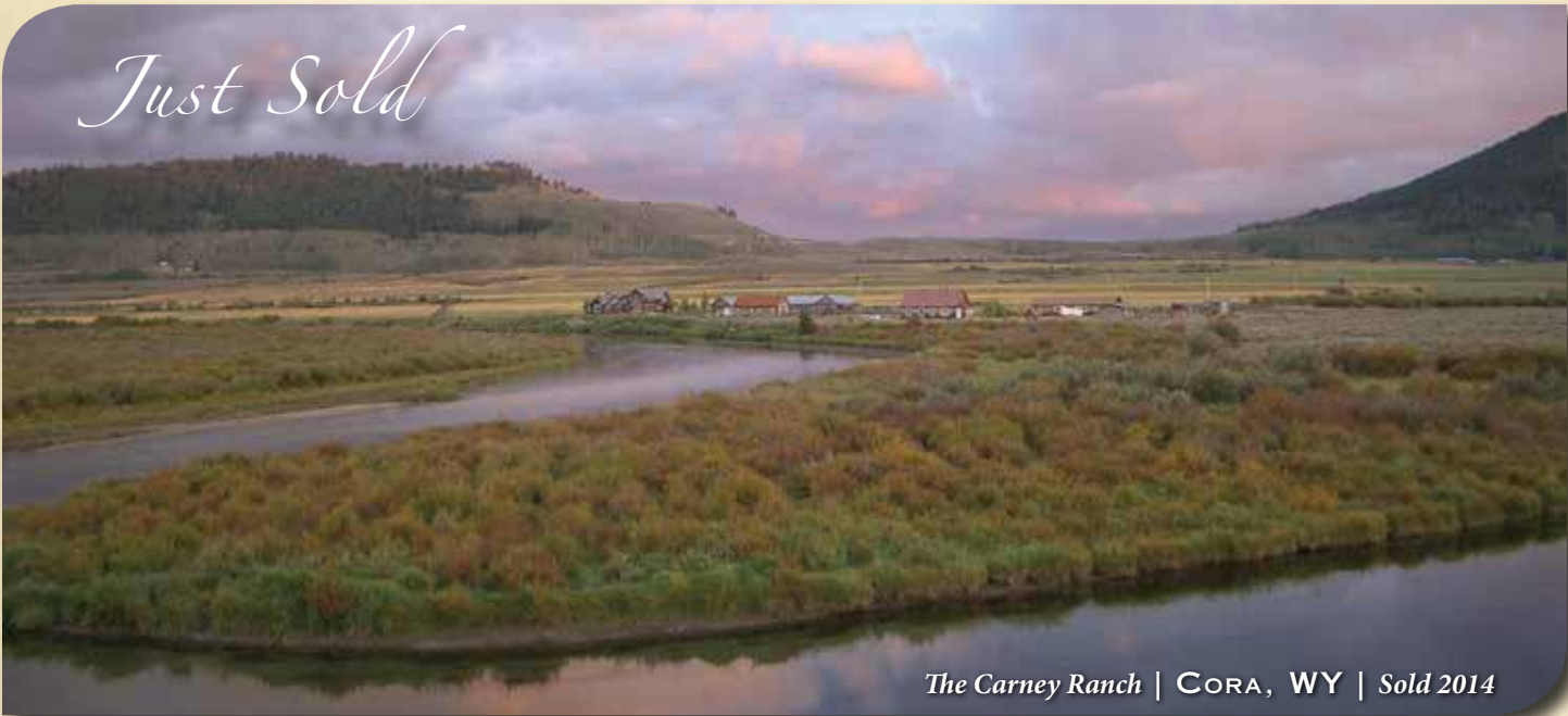
The Carney Ranch | CORA, WY | Sold 2014