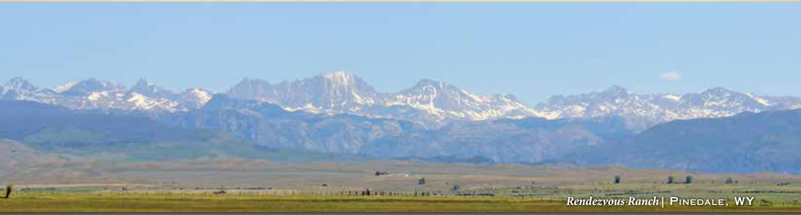
Rendezvous Ranch | PINEDALE, WY