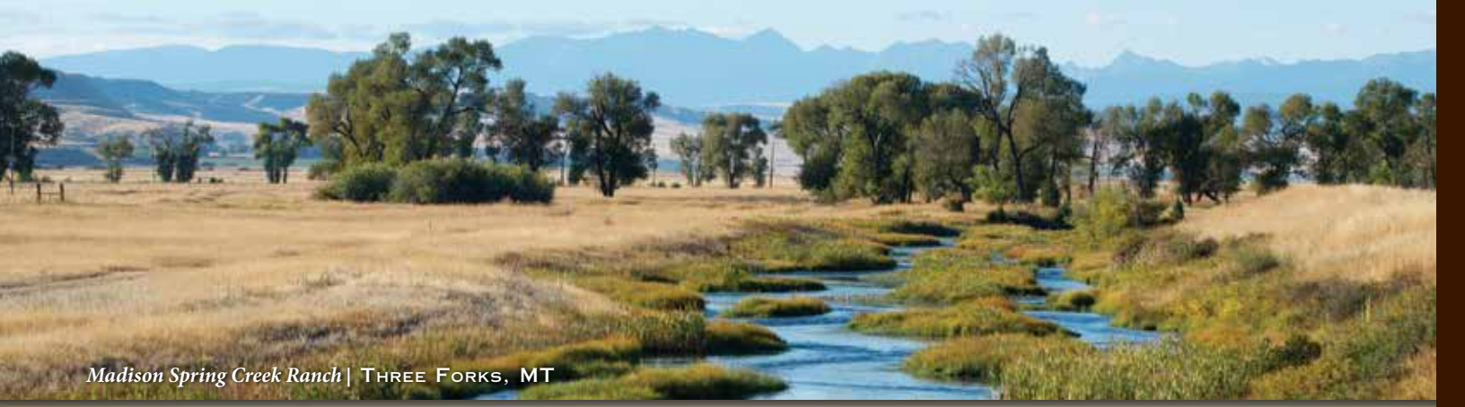
Madison Spring Creek Ranch | THREE FORKS, MT

After years of record run-ups, wheat prices are down 25% from 2012, and hay prices are generally down 15%, due to lower corn prices as a competing feed source in the dairies. The dips in grain prices are resulting in a plateau for the escalating farm values in the mid-western states. The expiration of hundreds of thousands of acres in Conservation Reserve Program (CRP) contracts is also pushing more acreage back into agriculture. It remains to be seen how the combination of increased acreage in production, world food demands, and weather patterns will affect commodity pricing and land values for pure agricultural and livestock operations. Ranches in the Rocky Mountain states have not seen the appreciation cycle that recently occurred in the mid-western states. In fact, Western ranch values today are roughly equal to those of 2003-2005 before the market spiked and subsequently dropped.